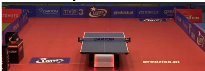
example - show court with BBGs zones

The clubs are recommended to make a training session with the BBGs.