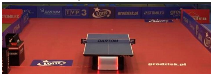
example - show court with BBGs zones

The clubs are recommended to make a training session with the BBGs.