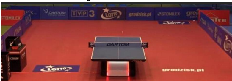
example - show court with BBGs zones

The clubs are recommended to make a training session with the BBGs.