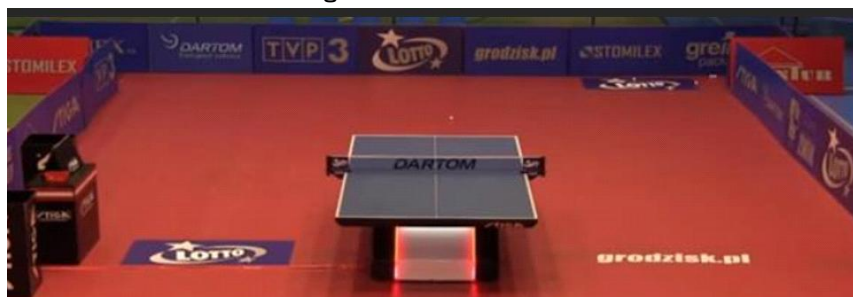
example - show court with BBGs zones

The clubs are recommended to make a training session with the BBGs.